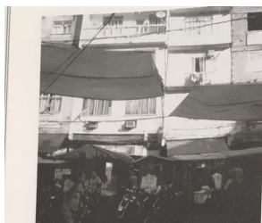
Blue canvases providing shade in an open market, Rio de Janeiro