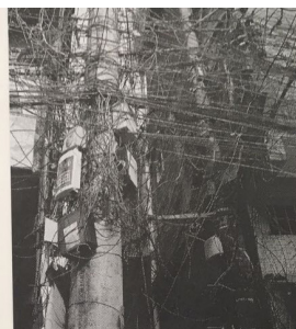
Rio das Pedras, Rio de Janeiro

A toldo is a fixed or adjustable canopy with a metal or wooden framework. It usually projects window and door openings and is composed of a stretchable material like canvas, acrylic fiber, cotton, or polyester. With its colorful patterns, it can be used for decorative purposes or can display advertisements. A toldo can be used to provide shade for a one-man kiosk (41) or a shop-workshop (55).